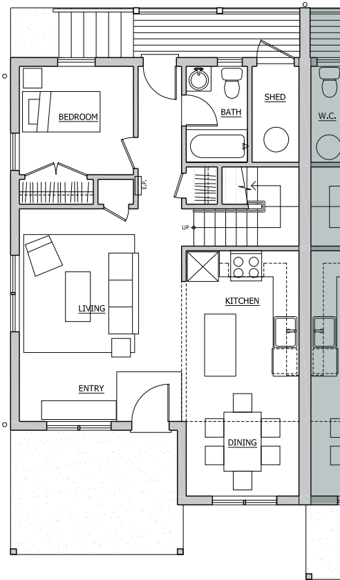
FIRST FLOOR PLAN 745 FT 2